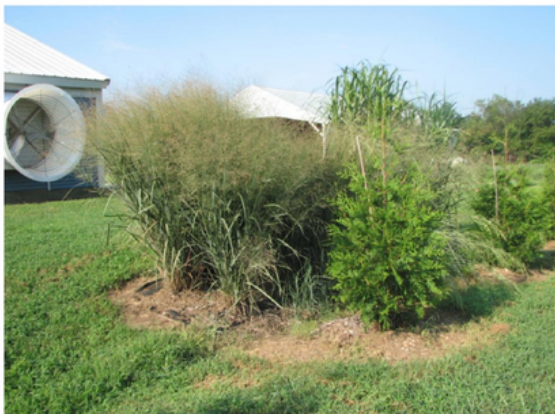
Vegetated buffer strips planted near this poultry house help improve air quality.

-The poultry industry has a tremendous footprint in Caroline County. District staff work with poultry farmers to install the latest best management practices at their facilities to protect soil, water, and related natural resources. Heavy use pads constructed at poultry house entrances help prevent nutrients from impacting waterways during cleanouts. Manure storage structures help protect poultry litter from the elements until conditions are right for field application or transport can be arranged. In addition, trees and shrubs planted near poultry houses help improve air quality and provide visual screens for neighbors.